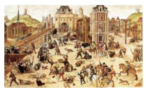
St Batholomew's Day massacre of Huguenots in Paris

- Huguenots chose exile in more friendly countries during a long period (probably around 1550-1750) but the main decade of exile was the 1680s when approximately 250,000 people fled France. It was at this time that the word refugee came into the English language. They went to any country that would accept them, allow them religious freedom and the chance to work to support themselves and their families. The principal places of refuge were the Netherlands, England, Germany, Switzerland and Ireland, although some refugees spread to as far away as Russia, Scandinavia, the American colonies, and South Africa. Many of their descendants live in Australia.